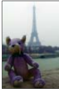
School mascot, Plato, visiting Paris