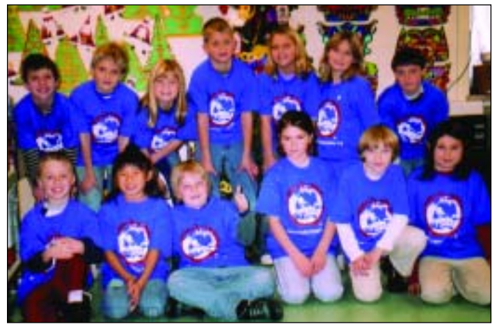
Class photo, Waupaca Learning Center, Waupaca, WI